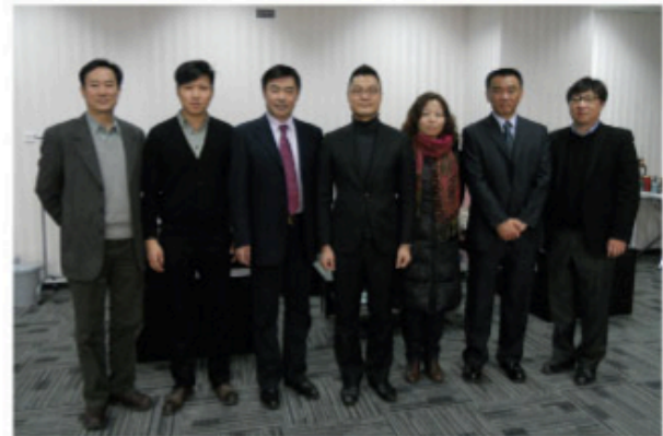
K Conference + BOSSA + Pearson together

THE PIE NEWS News and business analysis for Professionals in International Education